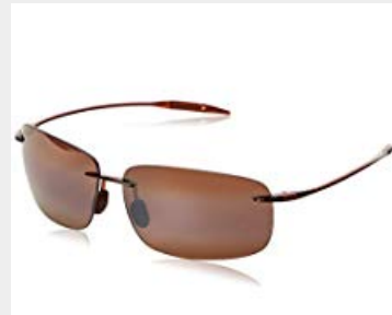
Breakwall Polarized Men's Sunglasses