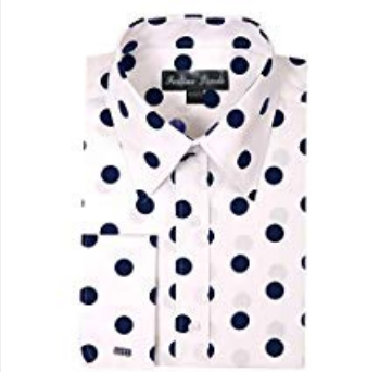
Men's 100% Cotton Big Polka-Dot Dress Shirt