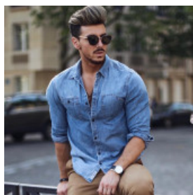
Men's Spring/Summer Look: Blue Jeans, White Sneakers