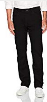
Men's Straight Fit Jeans