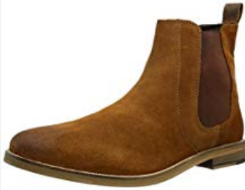
Men's Denham Chelsea Boot