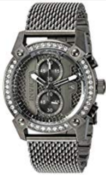
Men's 'Specialty' Quartz and Stainless Steel Casual Watch