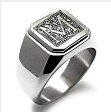
Stainless Steel Floral Monogram with Letter M