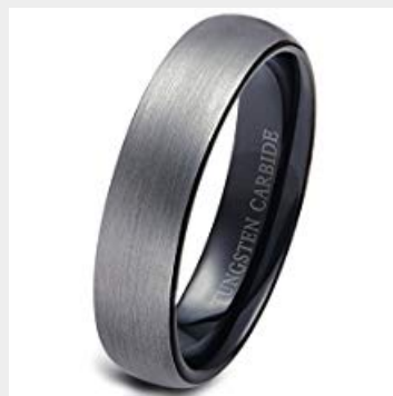
Brushed Ring for Men