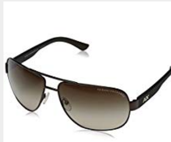
Armani Exchange AX 2012S Men's Sunglasses