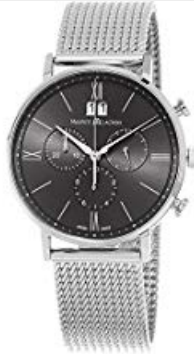
Men's Stainless Steel Swiss Chronograph Watch