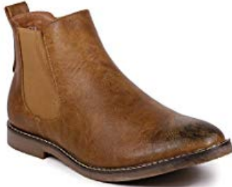
Men's Formal & Casual Dress Chelsea Boot