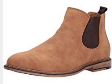
Men's M-Graye Chelsea Boot