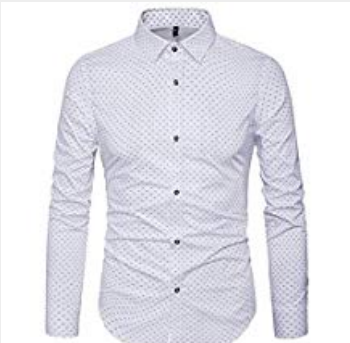
Men's Slim Fit, Polka-Dot Long Sleeve Shirt