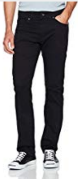
Men's Slim Fit, Straight Jeans