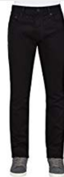
Men's Slim Fit Denim Jeans