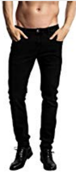
Men's Slim Fit Stretch Jeans