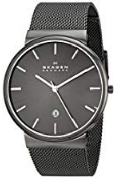
Men's Ancher Grey Mesh Bracelet Watch