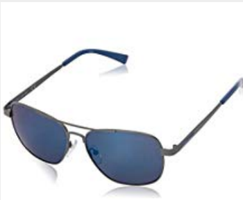
Men's Aviator Sunglasses R168S