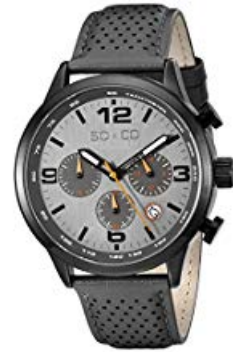
Men's 'Monticello' Quartz, Metal and Leather Sport