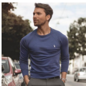
Menswear Look: Simple, Low-Key, But Stylish