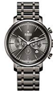
Men's Automatic Grey Sapphire Watch