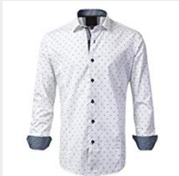
Men's Slim Fit, Long Sleeve Casual Shirt