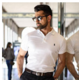
Men's Summer Style Look: White Polo-Shirt, Dark Check Trousers And Brown Loafers