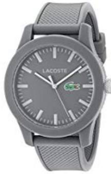
Lacoste Unisex Wrist Watch 2010767-12.12