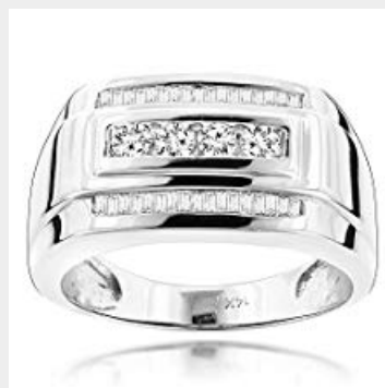
Men's 14K Gold, Natural 0.8 Ctw Diamond Ring