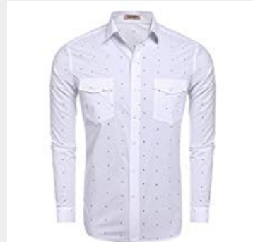
Men's Slim Fit, Contrast Long Sleeve, Casual & Dress Shirt