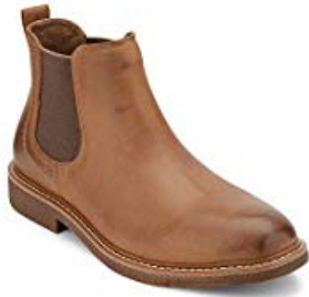
Men's Stanwell Chelsea Boot