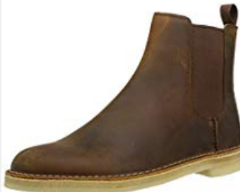
Men's Desert Peak Chelsea Boot