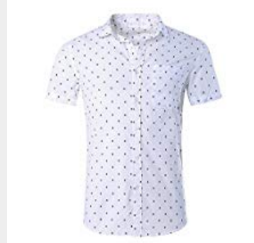
Men's Polka-Dot Print, Short Sleeve Casual Shirt