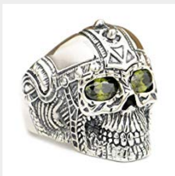
Sterling Silver Black Olive Eyes Skull Men's Ring