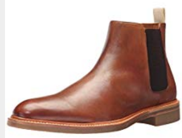
Men's Carson Chelsea Boot