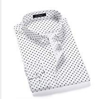
Men's Polka-Dot, Long Sleeve Shirt