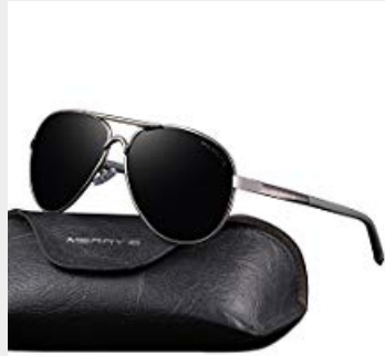
Men's UV400 Polarized Driving Sunglasses with