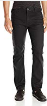
Men's Twill and Rinse Stretch Denim Basic Pants