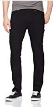
Levi's 511, Men's Slim Fit Stretch Jeans