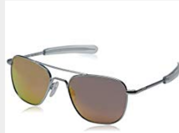
Randolph Aviator Sunglasses