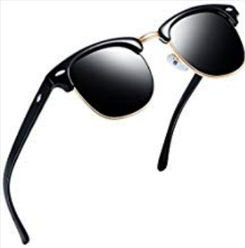
Semi Rimless Polarized Retro Sunglasses