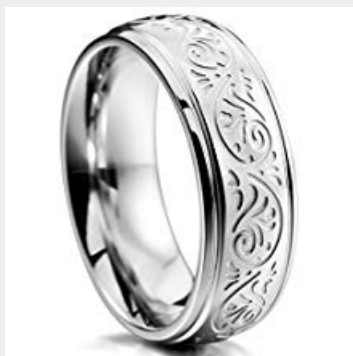
Silver Tone 7mm Stainless Steel Ring, Florentine Design